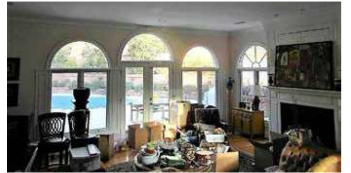
Living Room - before