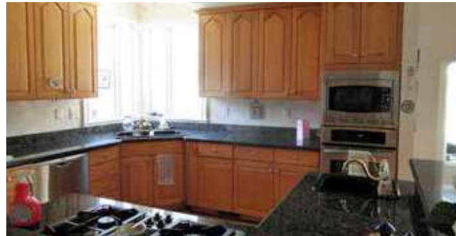
Kitchen - before