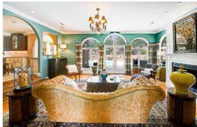
Living Room - After