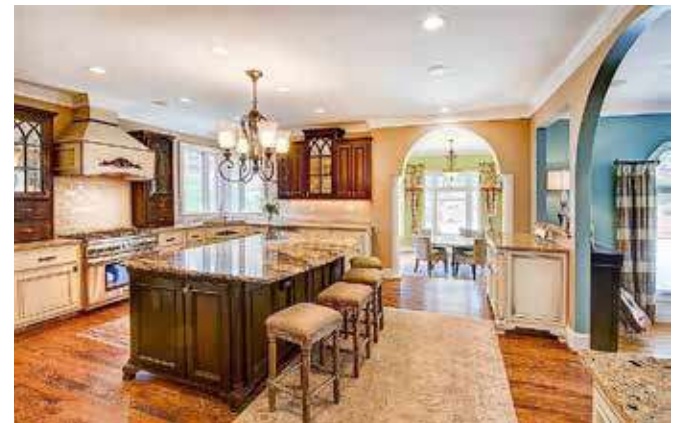
Kitchen - after